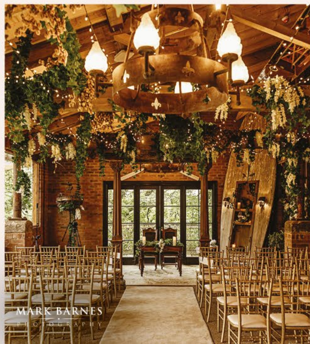
MARK BARNES Photography