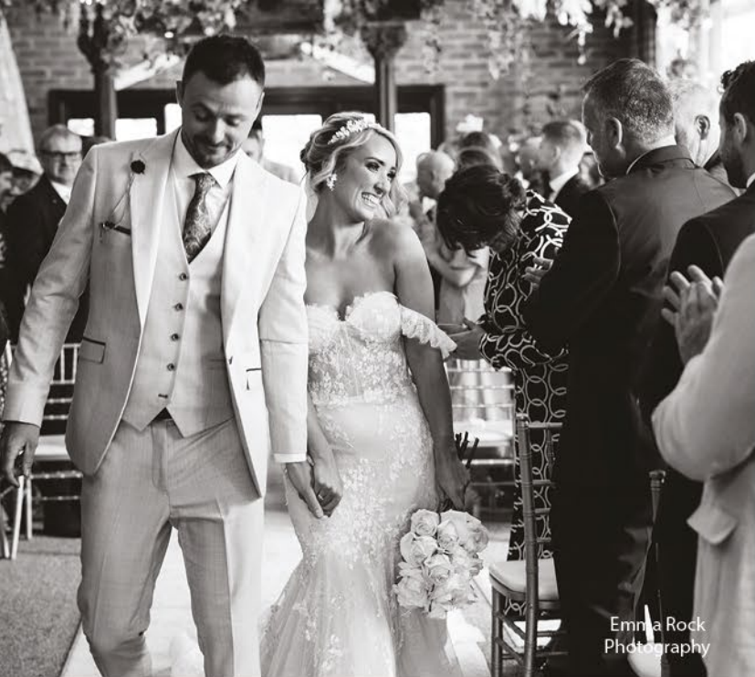
Emma Rock Photography